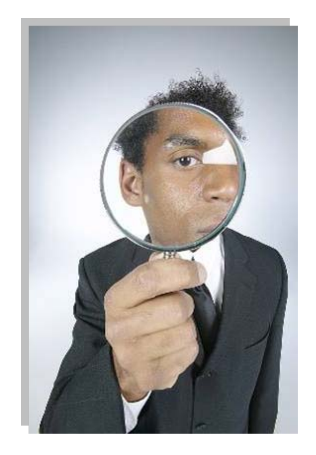
Produced by NICHCY, 2012